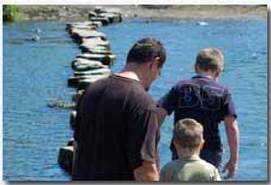
We encourage "Dad-friendly" activities because both boys and girls do better in life when their fathers stay involved.

To help ease the transition from Head Start to kindergarten, we also prepare the children by introducing them to kindergarten routines. A tour of their new school is usually provided. We also prepare the parents by reminding them what it's like to go to a regular school; and often help with the paperwork of registering their child.