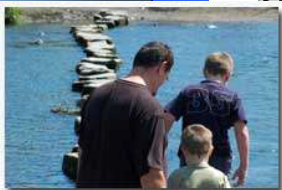
We encourage "Dad-friendly" activities because both boys and girls do better in life when their fathers stay involved.

To help ease the transition from Head Start to kindergarten, we also prepare the children by introducing them to kindergarten routines. A tour of their new school is usually provided. We also prepare the parents by reminding them what it's like to go to a regular school ; and often help with the paperwork of registering their child.